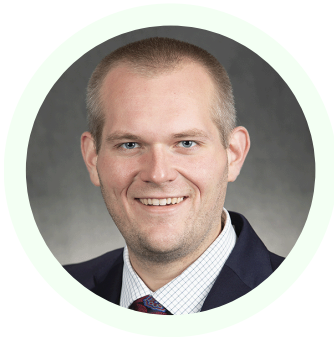
REP. BJORN OLSON