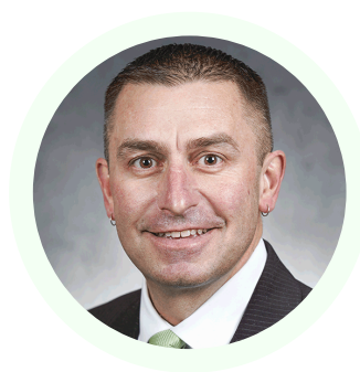
REP. JOSIAH HILL