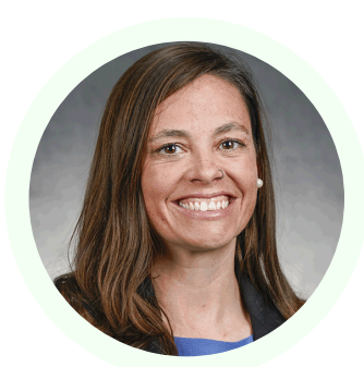
REP. KRISTI PURSELL