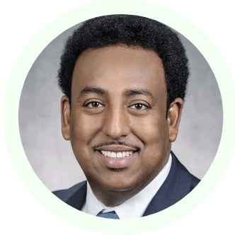
REP. SAMAKAB HUSSEIN